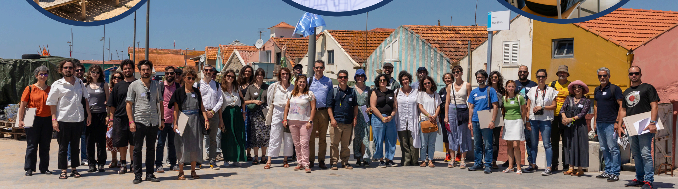
Angeiras, 2024