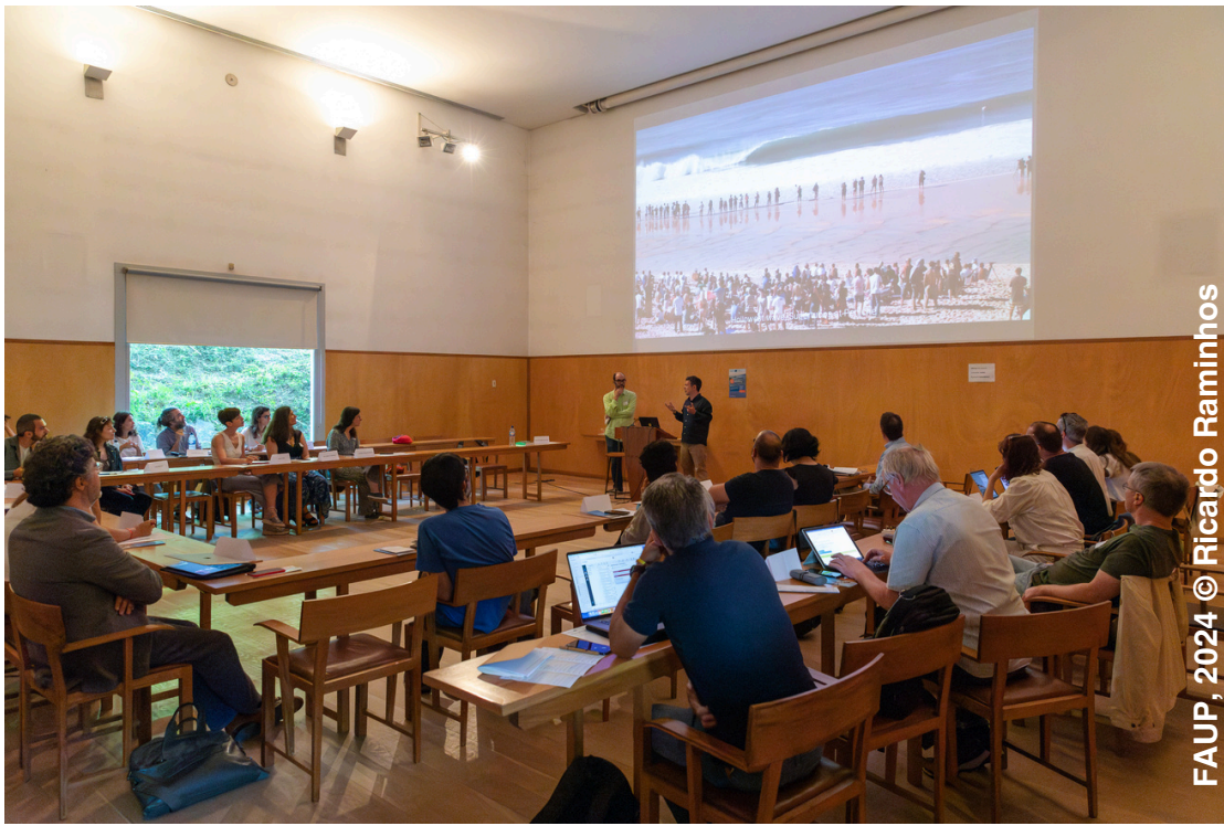
FAUP, 2024